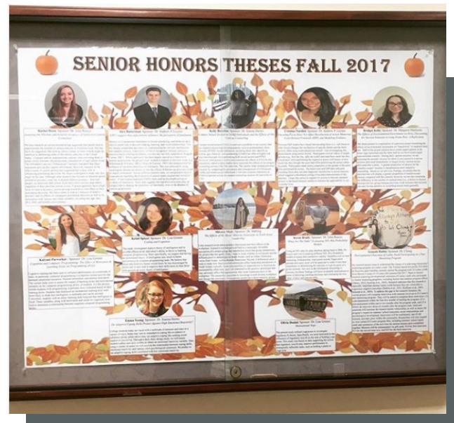
FALL 2017 SENIOR HONORS THESIS BOARD