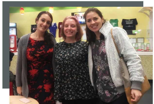
HSS DEAN'S LIST ICE CREAM SOCIAL

Over two hundred million people live outside the country in which they were born, worldwide. In the United States, nearly one out of every four people was either born in another country or is the child of someone who was. In the class, we will study the psychology behind these astonishing statistics. We will learn how immigrants come to understand themselves and their place in their adopted country, including the impact of immigration on integration, academic achievement, and health. We will also learn how people in the host country receive immigrants, including the causes of pro- and anti-immigrant attitudes.