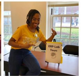
TCNJ psychology students demonstrating #hienergy and #hiachieving attitudes ( Instagram, 4/22/19 )