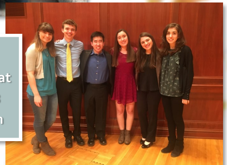
Psi Chi members at the 2018 Induction