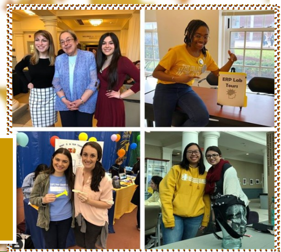
TCNJ psychology students demonstrating #hienergy and #hiachieving attitudes ( Instagram, 4/22/19 )

PSY 470-02: Senior Topics Study Group (every semester) Self-Regulation Dahling, TF 2:00 PM – 3:20 PM Prerequisite: PSY 299