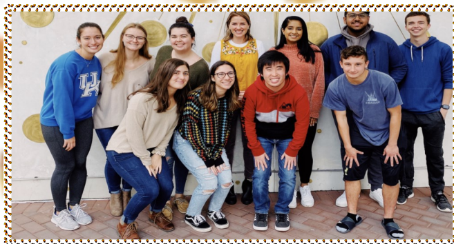
Psychology Students at the Spring 2020 Virtual Lab Olympics